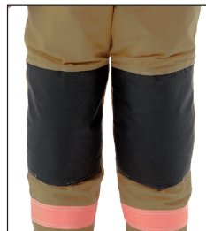
Knee reinforcements with Para-Aramid