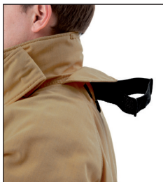
Integrated Drag Rescue Device

Approved according to NFPA and accepted by USCG.