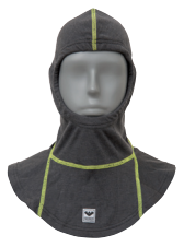
Firefighter hood Item No.: PS384367