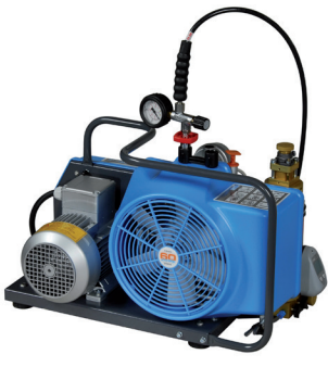
Compressor Item No.: 1045777