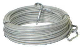
Fire proof safetyline Item No.: 1042277