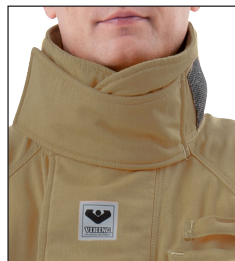
Collar strap for firm closure